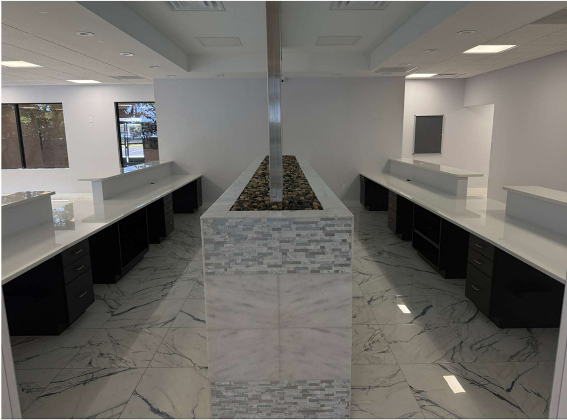
< Front Station - Side >