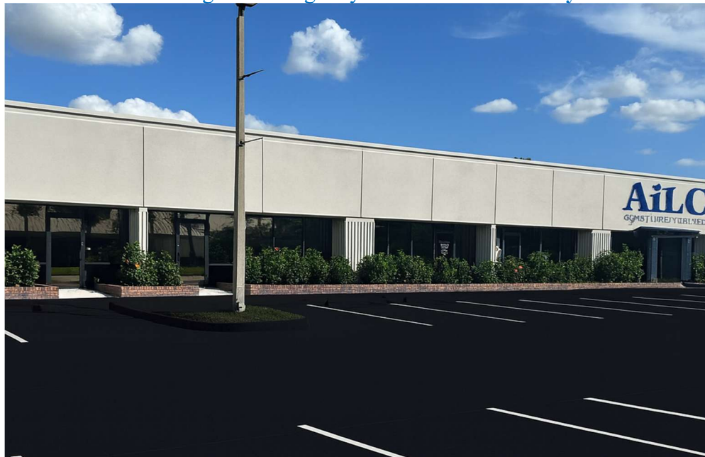
489 Semoran Blvd, Bldg. 493, Casselberry (Orlando) FL 32707